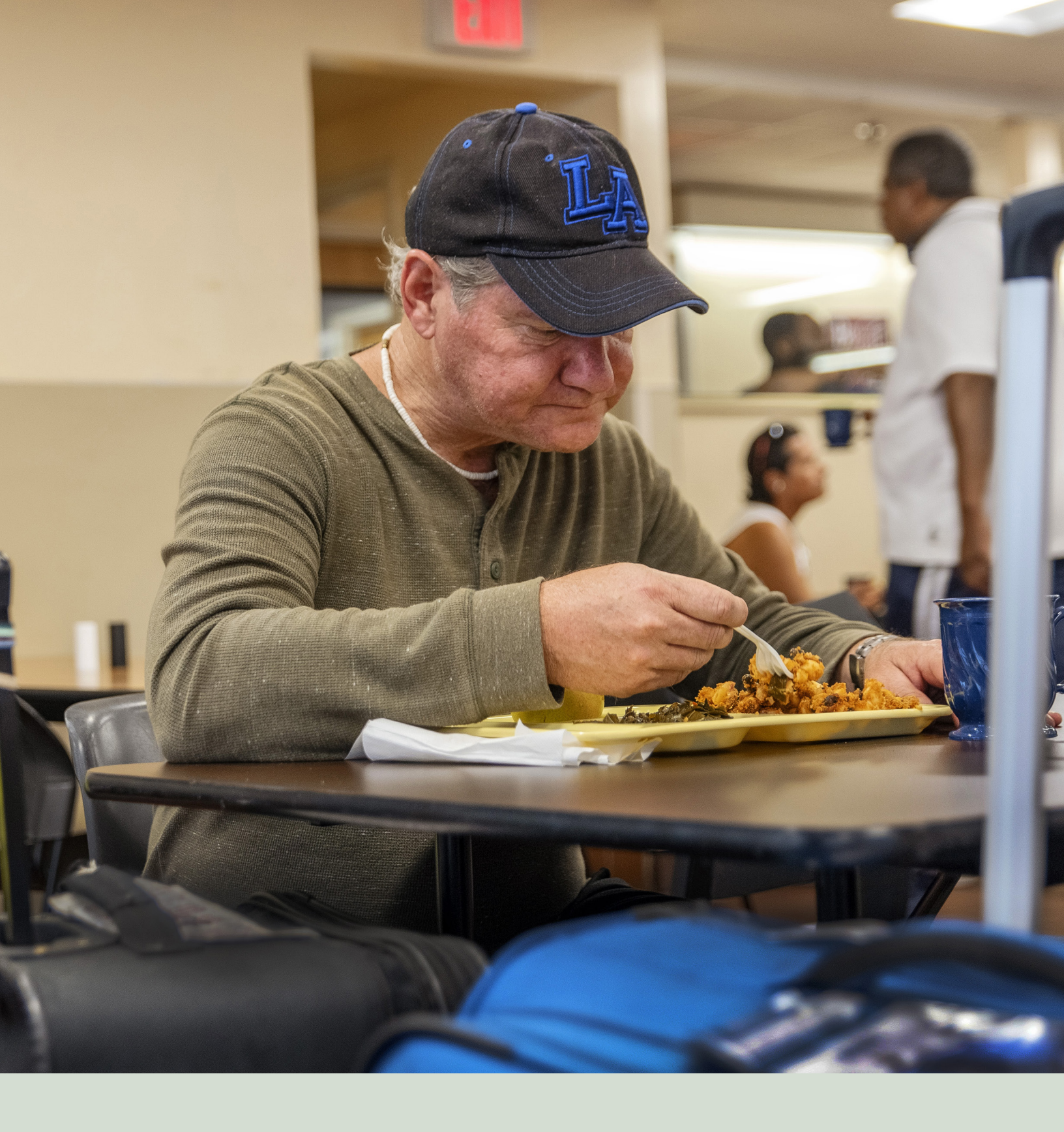
"Of course food is essential... However, even more importantly, we offer our guests respect. Everyone is treated like a human being."